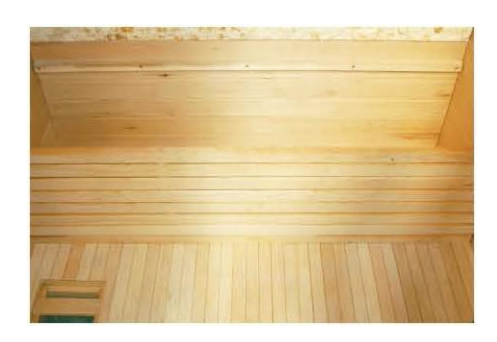
FIG-9 Assembling sitting board's support

6.Assembling sitting board's support and slide it down vertically into the slot within the inside wall. Put the sitting board horizontally on corresponding battens of the back panel. And tighten them with the screws. SEE FIG-9 & FIG-10