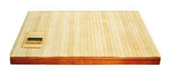
FIG-1 Placing bottom floor

1. Place the bottom panel in the desired location of your sauna. SEE FIG-1